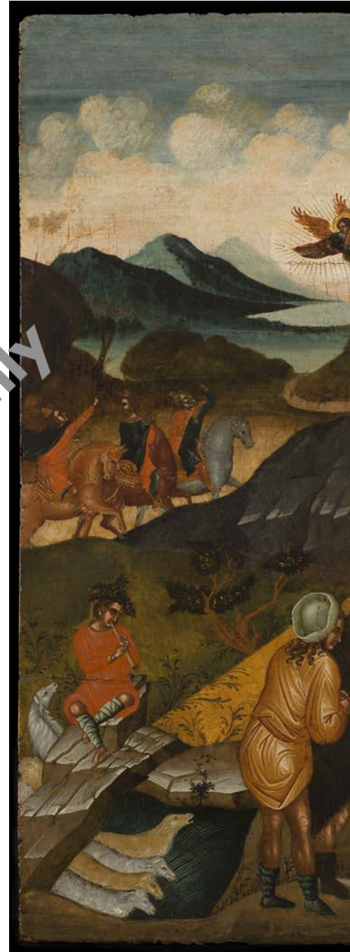
La Nativité Venetian school, ca. 1480–1500 Petit Palais, musée des Beaux-arts de la Ville de Paris